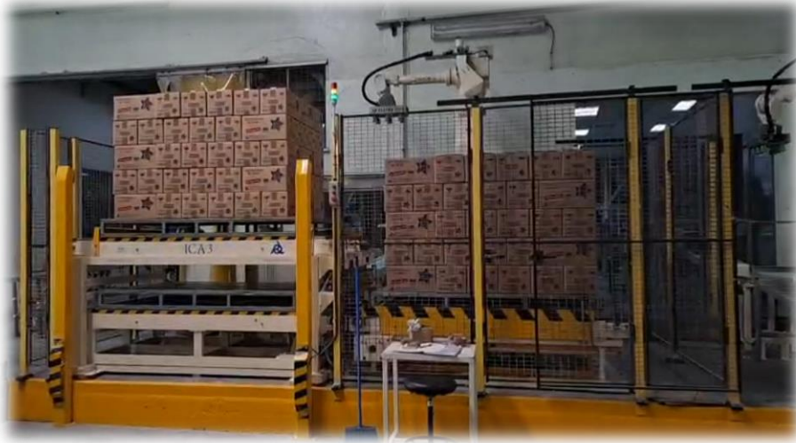
CUSTOMER : UFM 4 Line