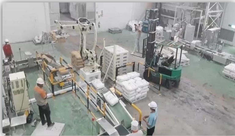
COMPANY : SINOE STARCH Line No.1