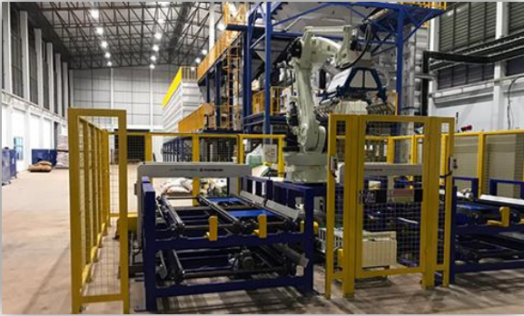
COMPANY : NAKORNNAYOK RICE RESEARCH CENTER