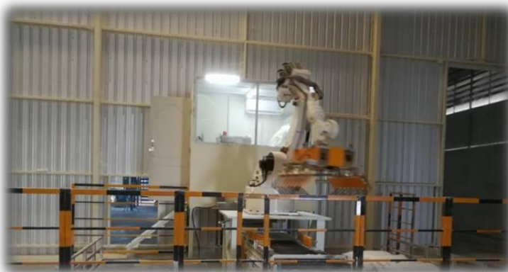
COMPANY : PHETHARA STARCH ( LINE 1 )