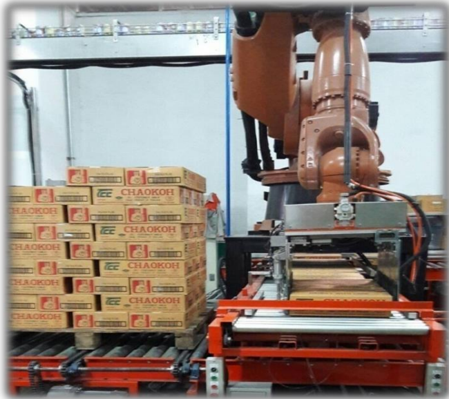
CUSTOMER : TCC COCONUT