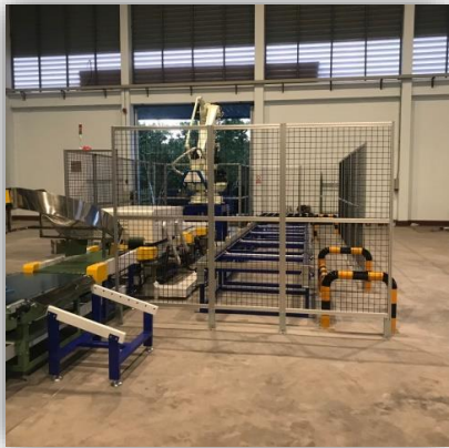
COMPANY : AMNAT-CHAROEN RICE RESEARCH CENTER