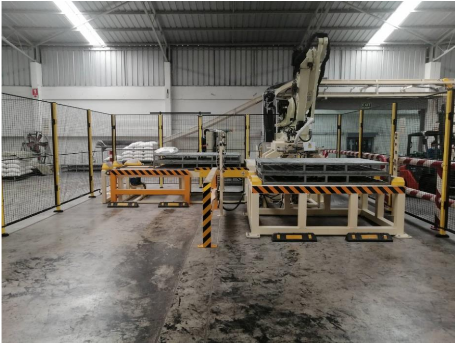
COMPANY : UNITED FLOUR MILL ( Line P8 )